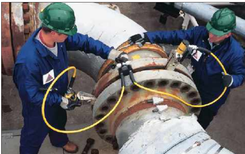
◀ Two FSH-14 spreaders used simultaneously with Enerpac handpump, hoses and AM-21 control manifold.