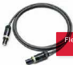
Flexible Inductor max. 180°C