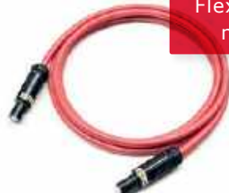
Flexible Inductor max. 300°C