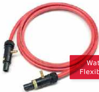
Watercooled Flexible Inductor