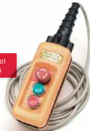
Remote Control (505 and up)