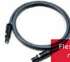
Flexible Inductor max. 500°C