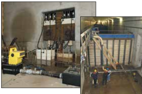
◀ Enerpac lightweight aluminum RAC-506 cylinders are ideal for wet environments such as this tunnel under the river (Holland High-Speed Train Line).